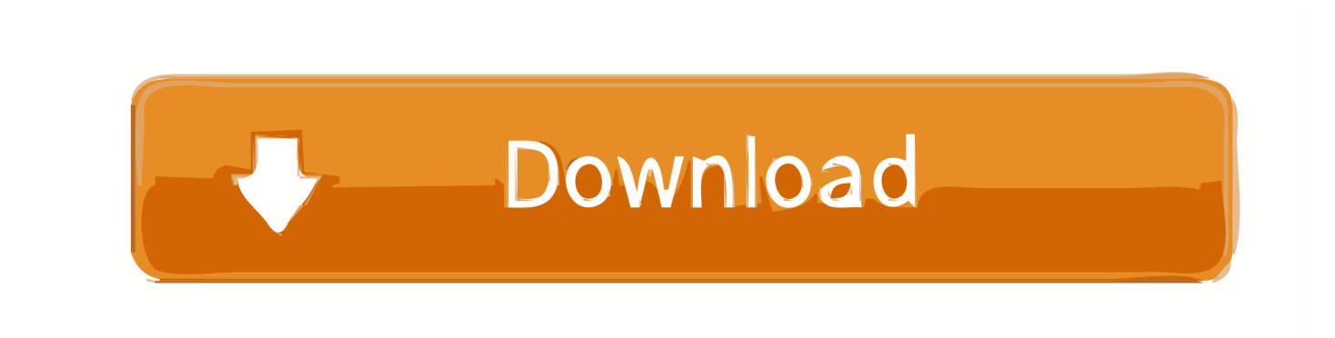
Ladsim 64 Bit